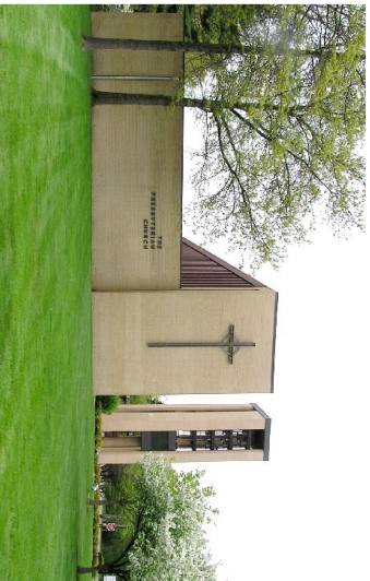
THE PRESBYTERIAN CHURCH OF LA PORTE

307 Kingsbury Avenue La Porte, IN 46350 219-362-6219