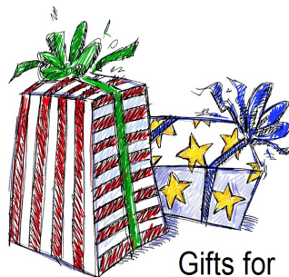
Gifts for those in the Military