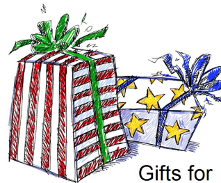
Gifts for those in the Military

If everyone in our church invited one friend each to church... WOW! We'd be packed! Get your courage up. Invite a friend to church on November 13th!